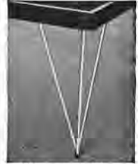
New metal legs

In fact, it's the biggest matchwinner everywhere—in halls, youth centres, and clubs all over the world. Why? Because the Dunlop Barna table is the finest high-speed surface you'll ever play on.