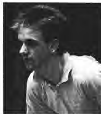
Jan-Ove Waldner, World Champion

matches ended at 5-0) has been replaced by a best of 5 format, still contested by three players, though somewhat under-employed ones. If the match goes the full distance (i.e. a 3-2 score line) one player will play two singles, the other two will only play one and a doubles. If the match ends early at, say, 3-0 two players will play one singles and one will play only one doubles – not much for which to travel half way round the world. I can imagine little which is more tepid or less attractive for players and spectators alike. I cannot think what possessed delegates to vote for something so destructive and sad. I can think of no other reason than the thought of little nations that a 3-0 defeat is better than a 5-0 one, if the contest with China really materializes. The Swaythling Cup has been responsible for so many great moments in our sport, so many glorious hours. In Dortmund all that was destroyed and something very luke-warm was substituted, without trial, without credentials. It is difficult to resist the conclusion that more and more officials are surfacing who do not like the sport very much and therefore that the less of it that is seen, the better. We seem to drift more and more into an era in which administrators matter more than players. There seem too many administrators