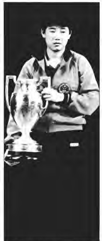
Ranked No. 51 in the world China's Qiao Hong lifted the womens singles world crown with a four-game win in the final over Li Bun Hui of North Korea.