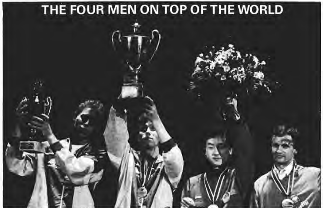
THE FOUR MEN ON TOP OF THE WORLD The four men who dominated the mens singles event in Dortmund on the victory rostrum, left to right Jorgen Persson (Sweden), Jan-Ove Waldner (Sweden) the new world champion, Yu Shentong (China) and the crowd's favourite character Andrzej Grubba of Poland.

The roars of the crowds in Germany, especially when there is a