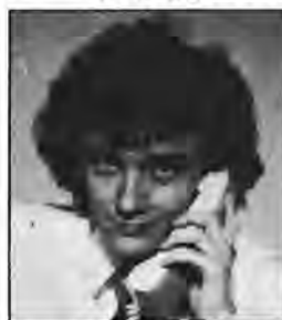
England's leading and most successful young coach

From all the players in his coaching squad, who wish him happy birthday with many thanks.