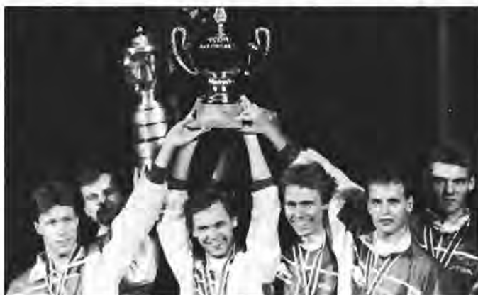
Sweden celebrates an historic victory

IN THE semi finals of the Corbillon Cup China beat Hong Kong 3-0, in a match where one of the Hongkong girls purposely appeared to use the wrong side of her bat. This followed the contro-