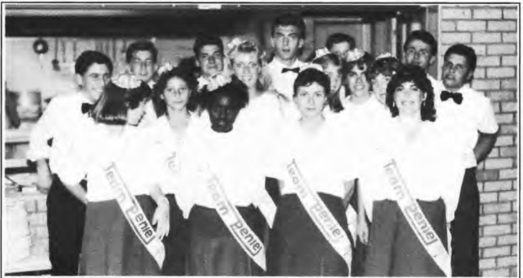
Some of Team Peniel supporters

In the 10 years in which Peniel have been playing table tennis it has come a long way, but what are its plans for the future?