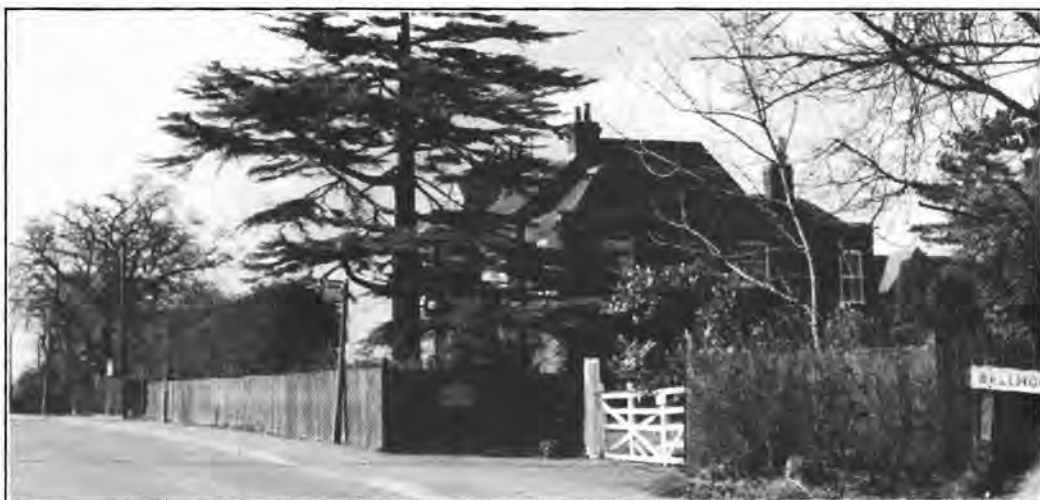
Peniel School in Brentwood

The school atmosphere is reflected in several ways. All the children mix together out of lesson times, the older ones taking responsibility for the younger ones, as if they are part of a large family, thus cutting across peer-groups and preparing them for later life.