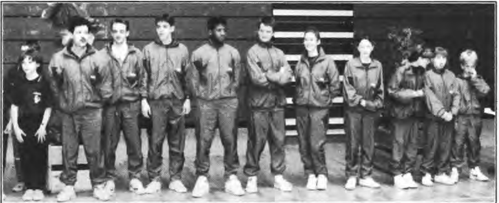
Peniel youngsters playing in France