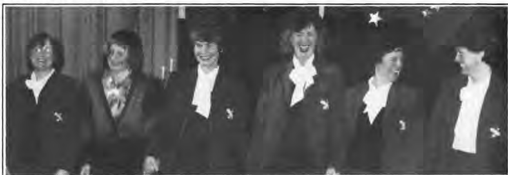
Some of the Peniel teachers during a Christmas party