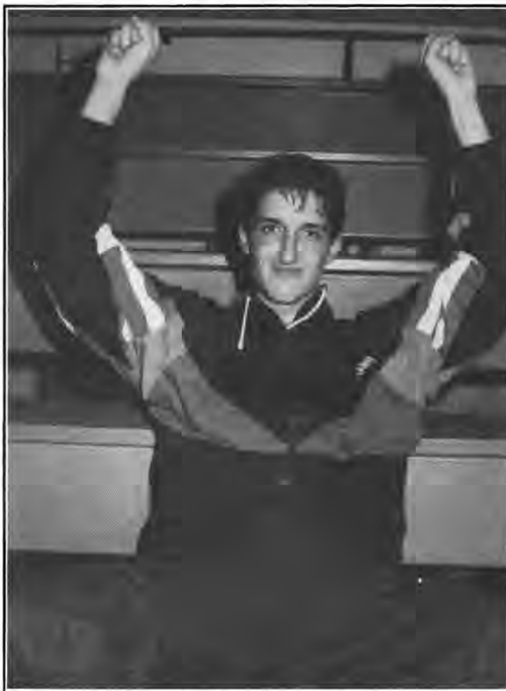
Mens Singles winner Band A Matthew Syed