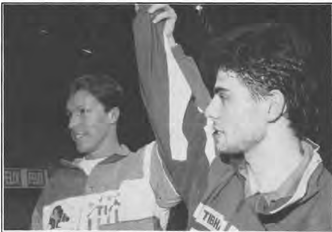
The ex-world champion Jan -Ove Waldner (left) and new one Jean Philippe Gatién will meet again at Birmingham

GIANT screen closed circuit television will be one of the exciting additions to expect at the championships. A special screen measuring seven metres by seven metres will be suspended from the roof to display live pictures from the days most important matches.